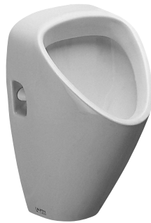
SLP 23 - CAPRINO